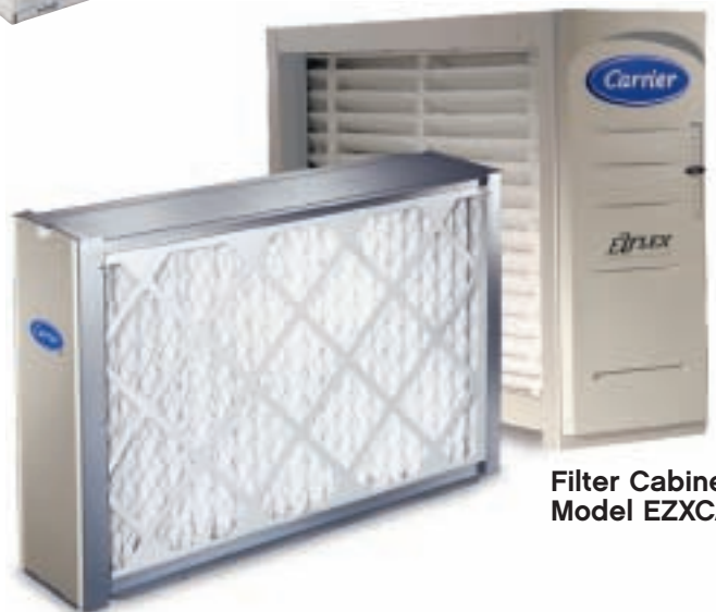
Filter Cabinet Model EZXCAB