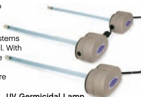
UV Germicidal Lamp Model UVL