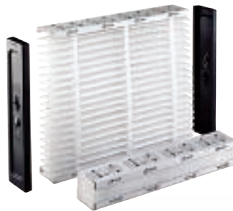
Carrier Filters: Model EXP EZ Flex, Model FILCC

The Carrier filter collects potential airborne contaminants as small as .3 microns. That's 600 times smaller than the point of a pin!