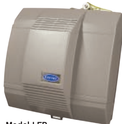
Model LFP Humidifier